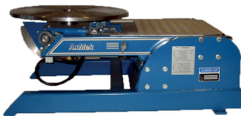
Flat top surface

The welding earth for the work table is separate from the electrical protective earth.