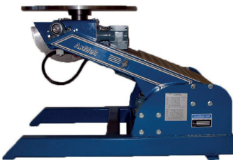
Stepless adjustment of all positions.