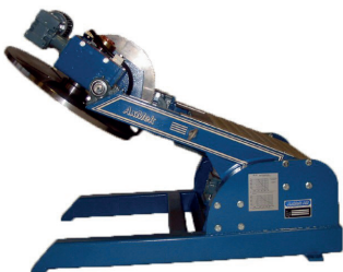
Tilting angle 65°