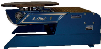
Flat top surface.

The welding earth for the work table is separate from the electrical protective earth.