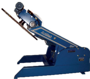
Tilting angle 165°