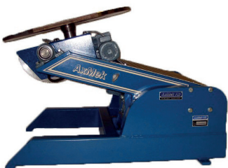
Stepless adjustment of all positions.